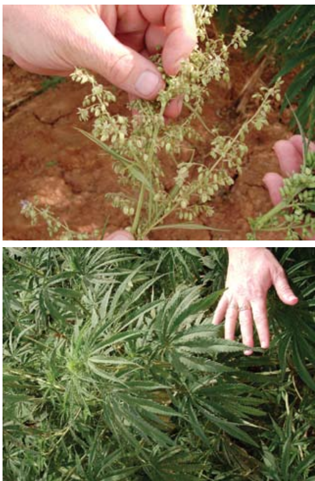
Figure 6. Photograph of Cannabis sativa . Top, staminate ('male') plant in flower; Bottom, pistillate ('female') plant in flower.

soil. Industrial hemp is intolerant to wet, flooded, or waterlogged soil. Seeds should be sown to 4–5 cm depth in non-crusting soils to achieve rapid germination to optimise weed suppressant qualities.