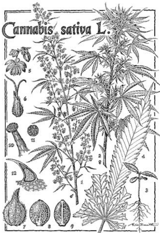
Cannabis sativa . 1. Flowering branch of male plant. 2. Flowering branch of female plant. 3. Seedling. 4. Leaflet. 5. Cluster of male flowers. 6. Female flower, enclosed by perigonal bract. 7. Mature fruit enclosed in perigonal bract. 8. Seed (achene), showing wide face. 9. Seed, showing narrow face. 10. Stalked secretory gland. 11. Top of sessile secretory gland. 12. Long section of cystolith hair (note calcium carbonate concretion at base).

Figure 4. Cross sections of stems at internodes of a fibre plant (left) and of a narcotic plant (right). Fibre cultivars have stems that are hollow at the internodes, i.e. less wood, since this allows more energy to be directed into the production of bark fibre.