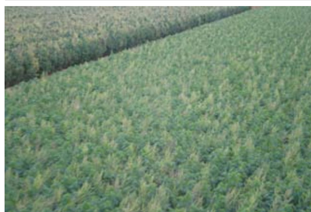
Figure 9. Aerial view of a well grown industrial hemp crop in southern NSW. Note the male (with seed heads) and the female plants.

Identifying suitable growing locations and streamlining farming and processing systems would also be useful initiatives for development of the industry.