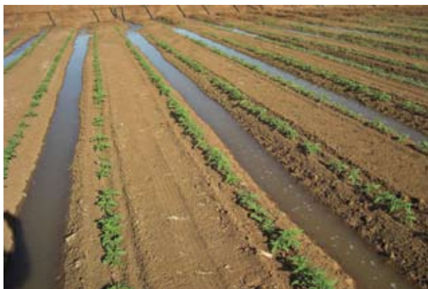
Figure 7. Well designed irrigation layouts minimise the chance of water logging.