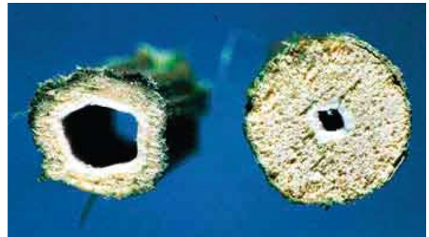
Figure 5. Transverse section of the stem of a Cannabis sativa plant.

Figure 4. Cross sections of stems at internodes of a fibre plant (left) and of a narcotic plant (right). Fibre cultivars have stems that are hollow at the internodes, i.e. less wood, since this allows more energy to be directed into the production of bark fibre.