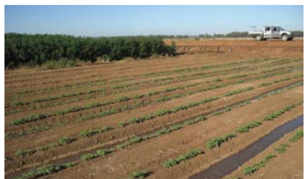
Figure 2. Young vegetative industrial hemp crop.

Figure 1. Early February planted industrial hemp foreground and early December planted industrial hemp background.